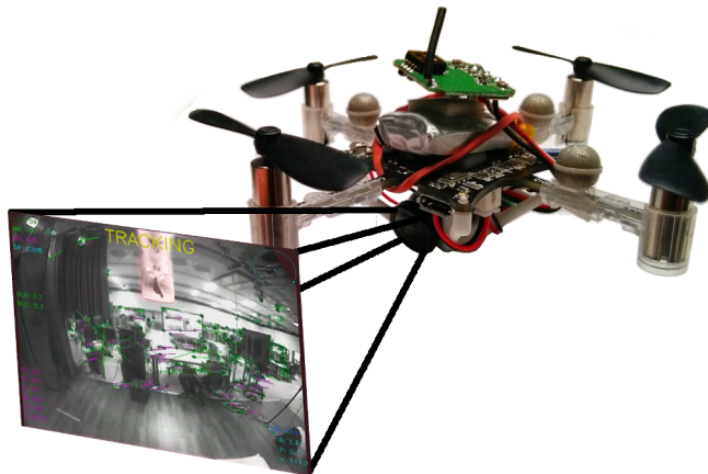
Fig. 1: Crazyflie nano-quadrotor with attached camera. 25 g total weight, 3.5 minutes of flight time and 9 cm across.

The research leading to these results was supported by the BMBF within the Software Campus (NanoVis) No. 01IS12057. We thank BitCraze AB for their on-going cooperation with us.